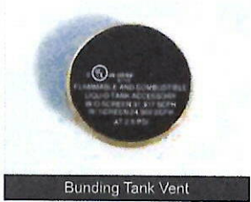
Bunding Tank Vent

All Kubes come complete with dipsticks and free vent pipe and fittings.