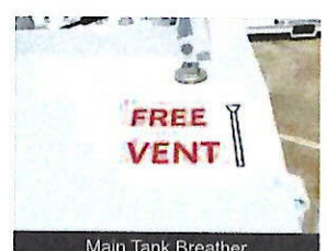
Main Tank Breather